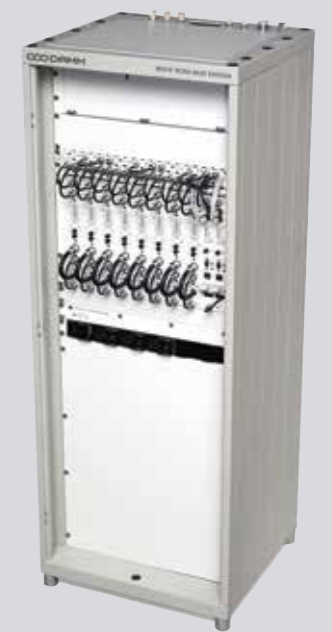
Indoor Base Station